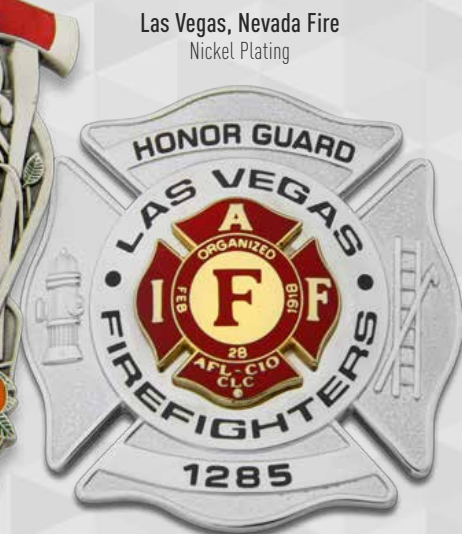
Las Vegas, Nevada Fire Nickel Plating