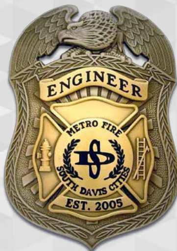
South Davis County, Utah Metro Fire White & Gold Satin Finish