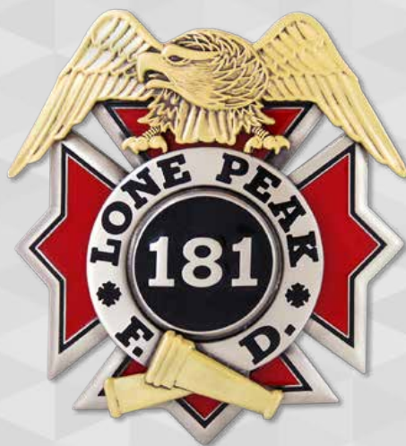
Lone Peak, Utah Fire White Satin Plating