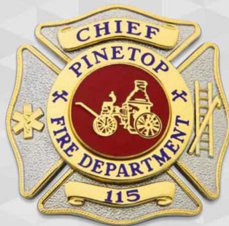
Pinetop, Arizona Fire Gold & Nickel Plating