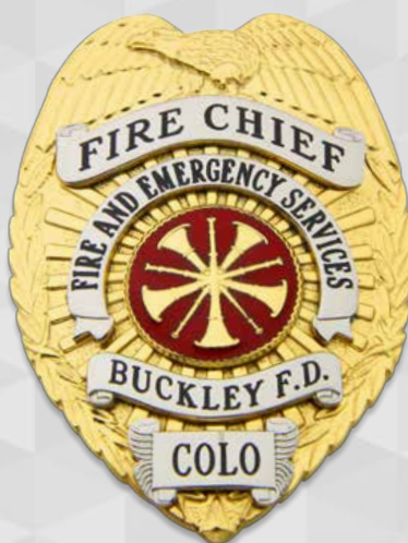
Buckley, Colorado Fire Gold & Nickel Plating