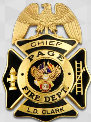
Page, Arizona Fire Gold Plating w/ Heavy Enamel