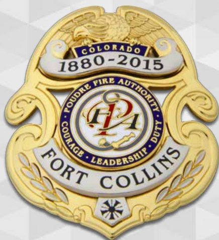
Poudre Fire Authority, Colorado Gold & Nickel Plating