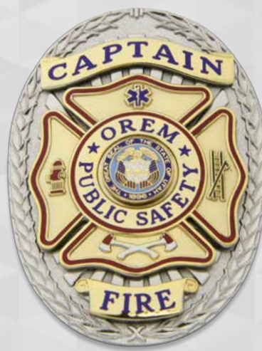
Orem, Utah Fire Gold & Nickel Plating