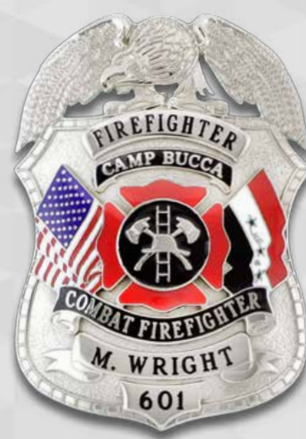
Camp Bucca Combat Fire Nickel Plating