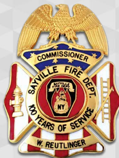
Sayville, NY Fire 100 Years of Service Gold Plating