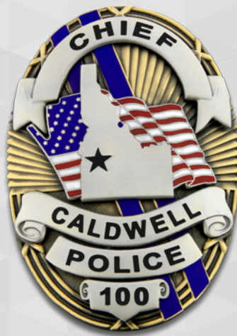
Caldwell, Idaho Police SWAT Gold & SWAT Nickel Plating