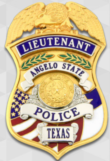
Angelo State, Texas Police Gold & Nickel Plating