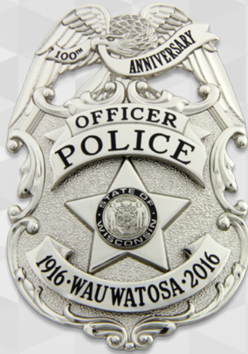
Wauwatosa, Wisconsin Police Nickel Plating