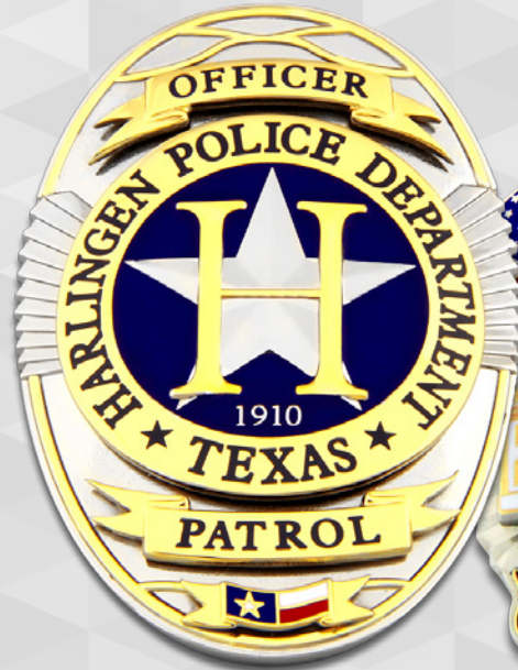
Harlingen, Texas Police Gold & Nickel Plating

Contact your SymbolArts Representative to start the design process today.