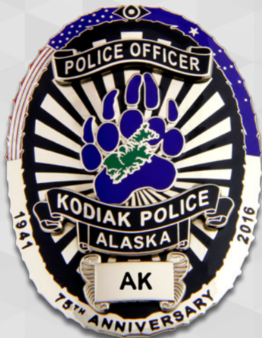
Kodiak, Alaska Police Nickel Plating