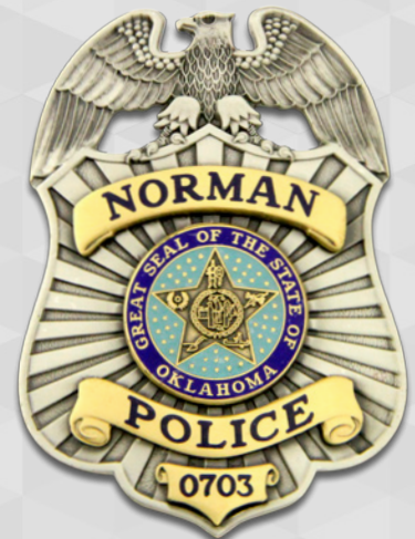
Norman, Oklahoma Police White Satin w/ Two-Tone Plating