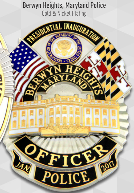
Berwyn Heights, Maryland Police Gold & Nickel Plating