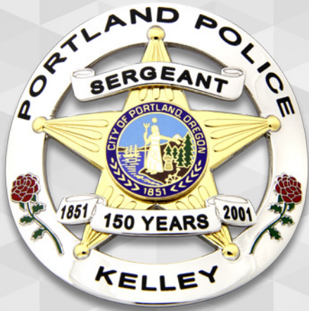
Portland, Oregon Police Gold & Nickel Plating