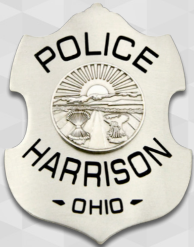
Harrison, Ohio Police White Satin Plating