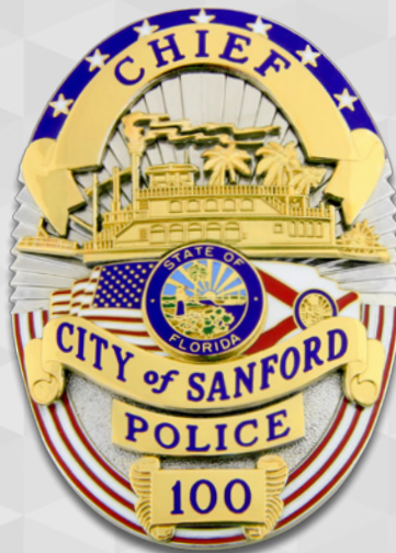
Sanford, Florida Police Gold & Nickel Plating