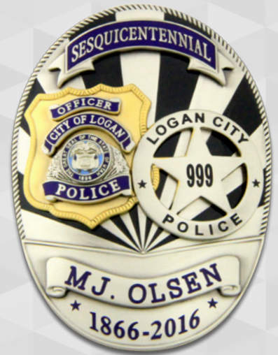
Logan City, Utah Police Gold & White Satin Plating